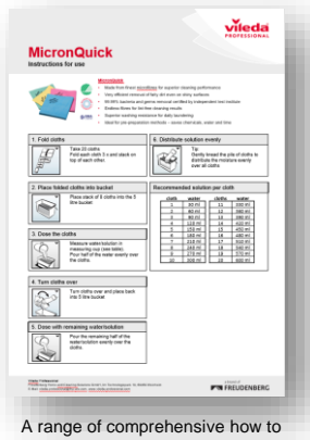
use guides available for training

For more information on infection prevention and the basics of microbiology contact Vileda Professional